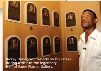
Rickey Henderson reflects on his career during a visit to the legendary Hall of Fame Plaque Gallery.