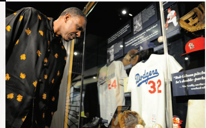
Hall of Famer Andre Dawson examines artifacts from the 1960s on the Museum's timeline.