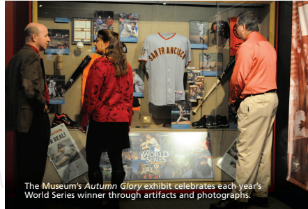
The Museum's Autumn Glory exhibit celebrates each year's World Series winner through artifacts and photographs.