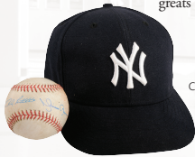
Cap worn by Andy Pettitte and ball signed by Pettitte and Mariano Rivera when the Yankees' duo set a record with their 58th win/save together.

Stroll through the Hall of Fame Plaque Gallery and stand among the absolute greatness that is represented here. Of all players skilled enough to appear in a major league game, only one percent – one in every 100 – are represented with a plaque in Cooperstown. Here you'll see the plaques of Ruth, Gehrig, Cobb, Williams, Clemente, Berra, Yastrzemski, DiMaggio, Mantle, Ripken and the other greats to have played the game.