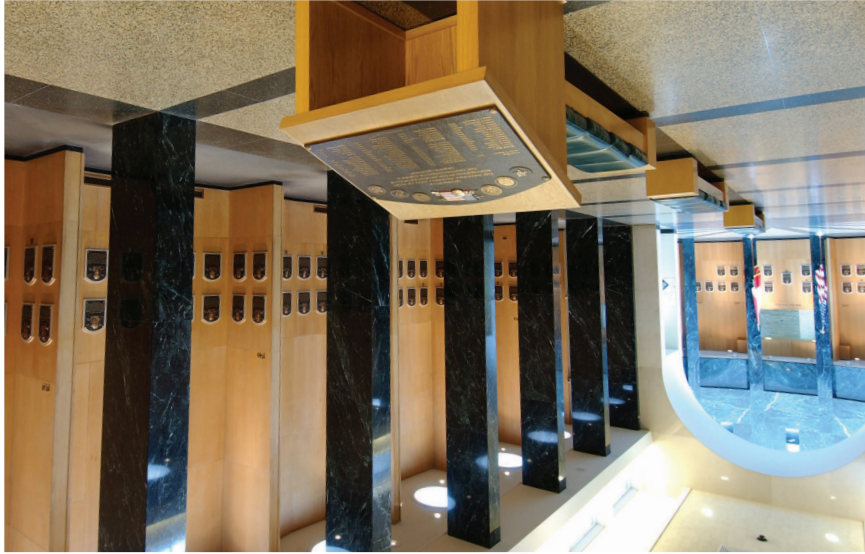
HALL OF FAME PLAQUE GALLERY

ELLENCE. CONNECTING GENERATIONS. PRESERVING HISTORY. HONORING EXCELLENCE. CONNECTING GENERATIONS.