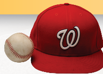
Cap and ball used by the Nationals Stephen Strasburg during his 14-strikeout big league debut.

Hall of Fame Induction Weekend is held annually, usually the last full weekend in July. The newest inductees join the greatest team ever on Sunday at the Induction Ceremony at the Clark Sports Center, while award winners are honored during Saturday's Awards Ceremony at Doubleday Field. Family-friendly events take place all weekend long.