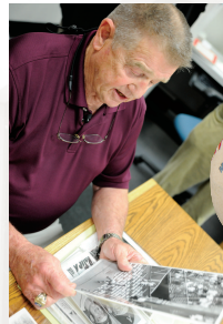
Hall of Famer Whitey Herzog views photos at the Hall of Fame Library.

A visit to the Hall of Fame offers more than just a tour through baseball history. Daily summertime programs and year-round special events make a visit to Cooperstown an exciting experience for the entire family.